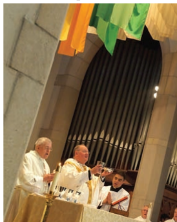
Archbishop Timothy Dolan, Celebrant, 475th Anniversary Mass